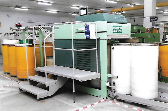
A view of new “RIETER – RSB – D50 Draw Frame” Machine installed in our ‘A Mill’ at Rajapalayam.