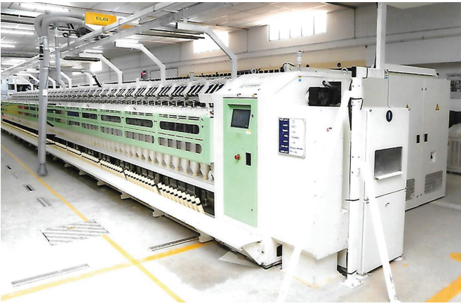
A view of new “LMW - LF 4280 A – Simplex” Machine installed in our ‘Unit – II’ at Rajapalayam.