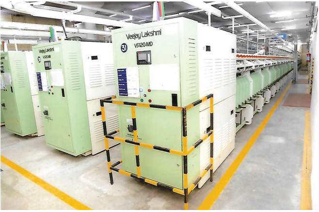
A view of new “Veejay Lakshmi - VJ-120-MD” TFO Machine installed in our ‘OE Hall’ at Rajapalayam.