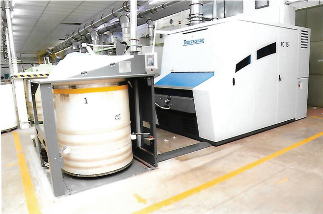
A view of new “TRUTZSCHLER - TC 15” Carding Machine installed in our ‘Unit – II’ at Rajapalayam.