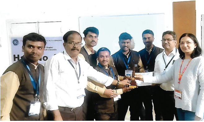
Our Vice President – HR receiving the “Meritorious Award - 2022” from Quality Circle Forum of India at Aurangabad for the Quality Concept presentation.