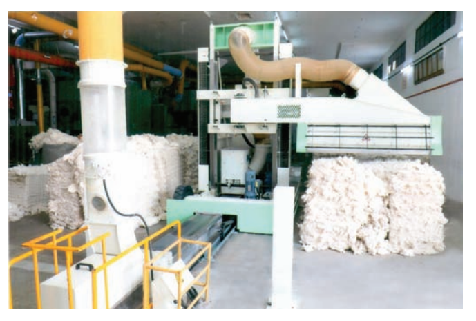
A view of newly installed "LMW Swift Floc LA21" Bale Plucker machine in our OE Hall at Rajapalaiyam.