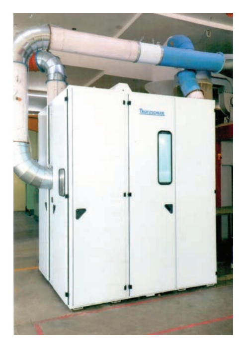
A view of newly installed "TRUTZSCHLER Dustex DX" machine in our OE Hall at Rajapalaiyam.